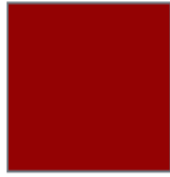
T009-RD03 Red 90% gloss