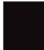
H302-BK46 Black 20% Gloss