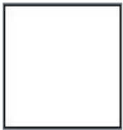
P009-WH14 White 90% Gloss