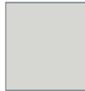
T009-GR230 RAL 7035 Gray 90% Gloss