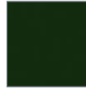
C006-GN03 Green 60% gloss