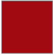
P009-RD02 Dark Red 90% gloss