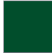
T007-GN13 D.O.T. Green 70% gloss