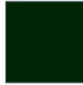
T007-GN16 Traffic Green 70% gloss