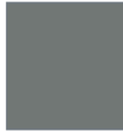
P004-GR16 ANSI #61 Gray 40% Gloss