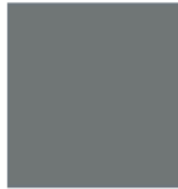
P004-GR09 ANSI #49 Gray 40% Gloss