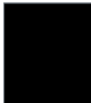
T006-Bk05 Black 60% Gloss