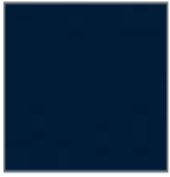
T008-BL20 Dark Blue 80% gloss