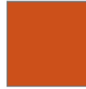
T009-OG26 International Orange 90% gloss